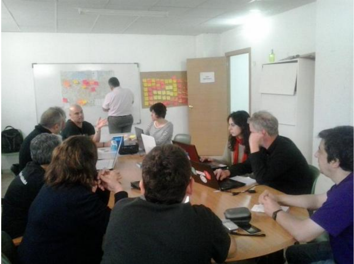
Figure 3: Mapjamming in Gijon, 2014.

communal learning processes mainly by event organization, and initiatives aimed at achieving democratization of or facilitation of open access to various processes of production, consumption, ownership and learning.