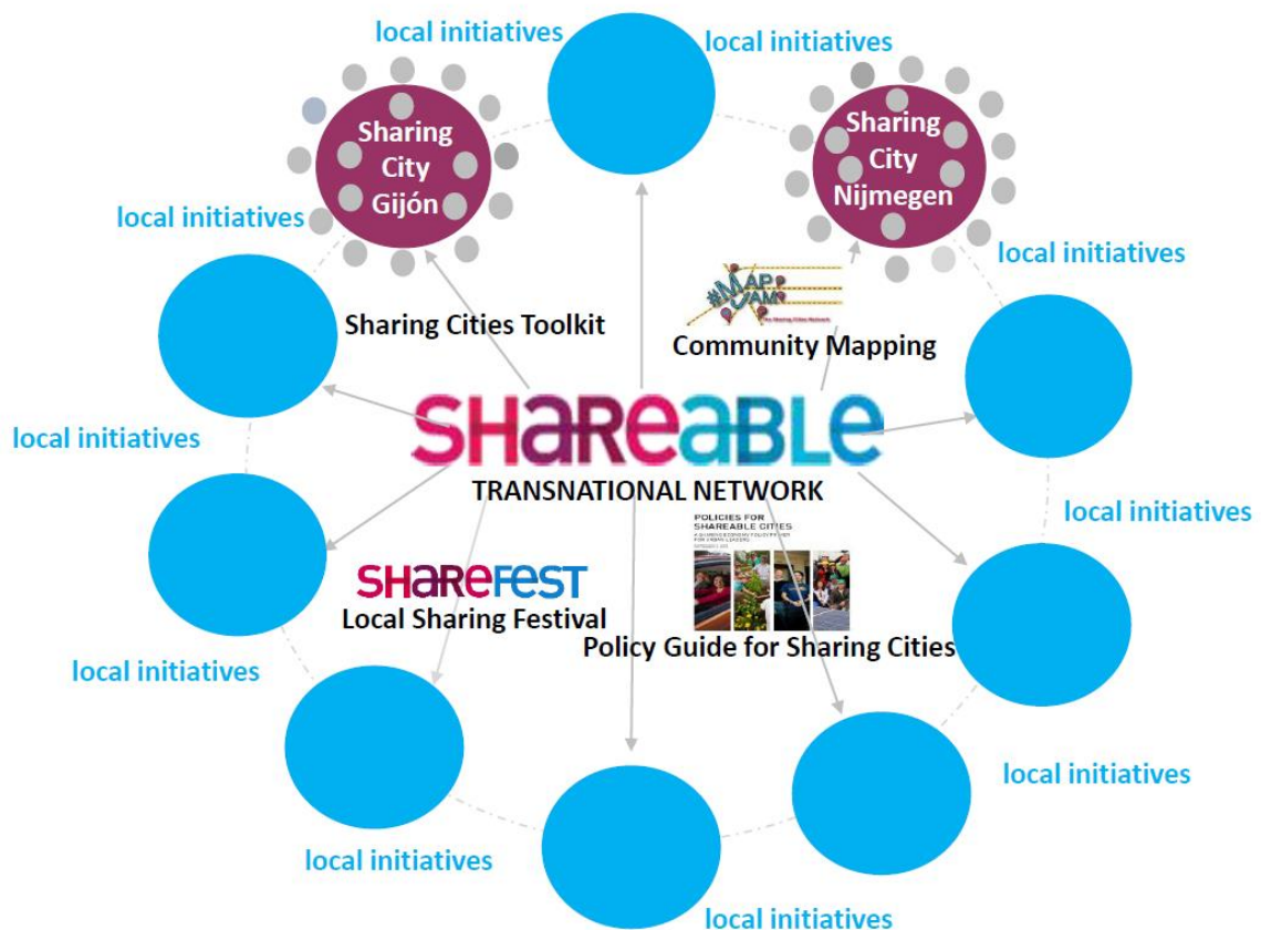
Figure 1: Case demarcation visualization for Shareable's Sharing Cities Network and its relations to local initiatives.

As figure 1 visualizes, Shareable is what TRANSIT defines as a Transnational Network. The Toolkit, Community Mapping, the Festival and the Policy Guide are means through which Shareable's Sharing Cities Network is taking shape. The Sharing Cities Network consists of various local initiatives worldwide, mostly concentrated in the United States and Europe. Nijmegen and Gijón were chosen as the local initiatives.